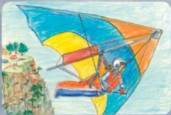
3rd Place Winner - Junior, USA

Once received, entries become (and remain) the property of the State Sponsor and may be used for a variety of purposes. Those forwarded for international judging become (and remain) the property of the Federation Aeronautique Internationale (FAI).