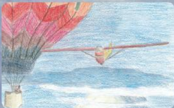
1st Place Winner - Junior, USA

Now, it's your turn to think about all the ways people travel through the sky with the power of the wind alone. Grab your favorite colored pens, pencils, or paint and create a poster celebrating the wonder that is Silent Flight.